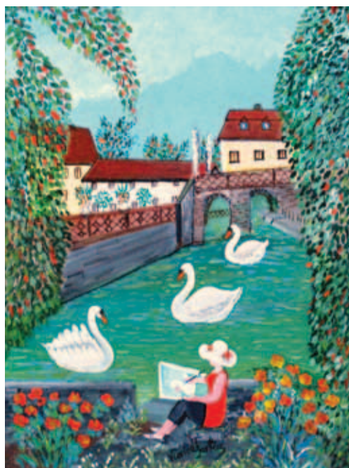
The Chateau Graden, 2018