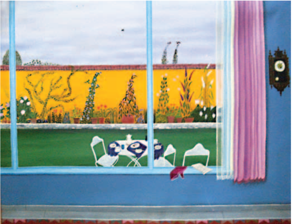
Afternoon Tea, 2017