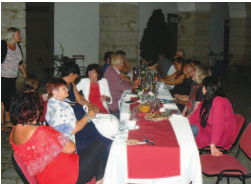
A final shot and, friends, see you again at Lysice sometime