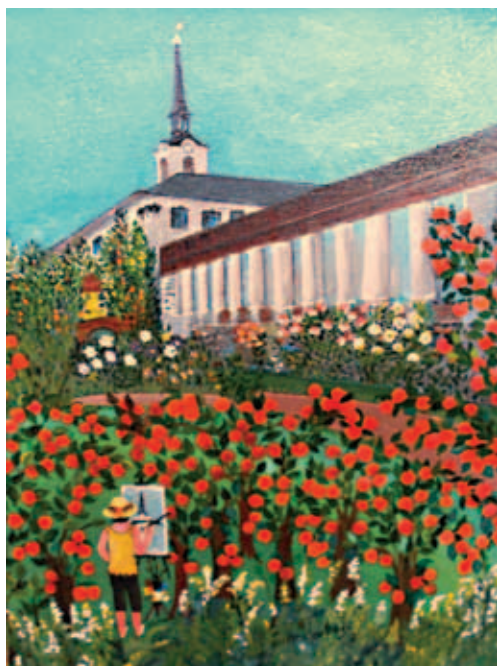
A Painter in the Apple Orchard, 2018