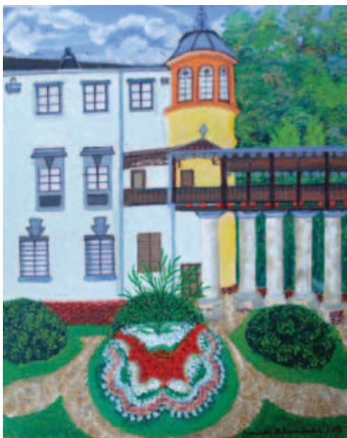
The Yellow Tower of the Lysice Chateau, 2018