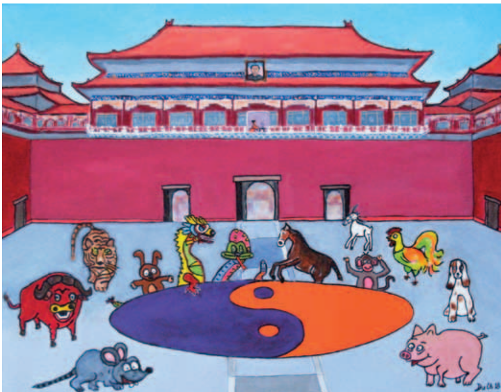
The Chinese Horoscope, 2018