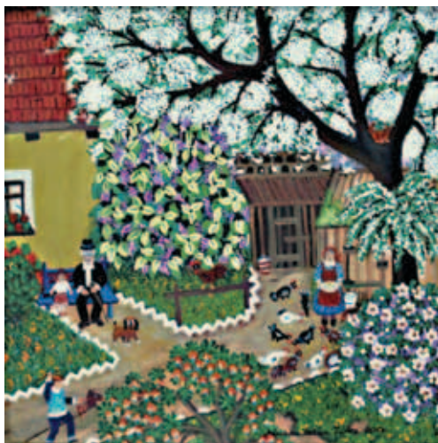
The Farmyard, 2017