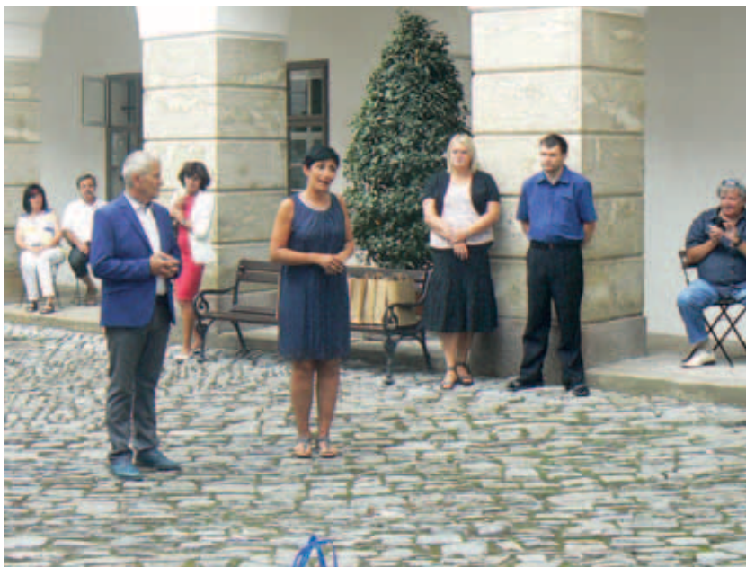
Awarding diplomas and plaques