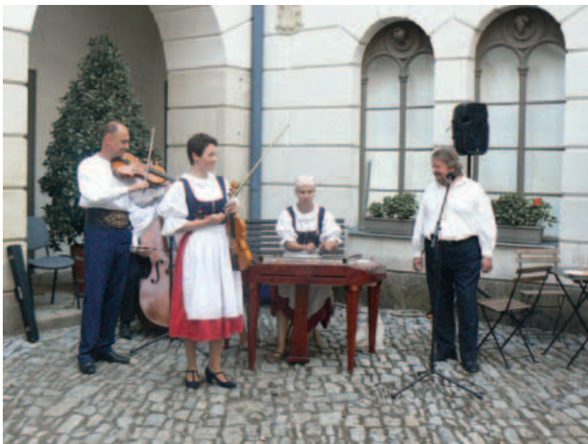
The Majorán dulcimer band provided a pleasant atmosphere