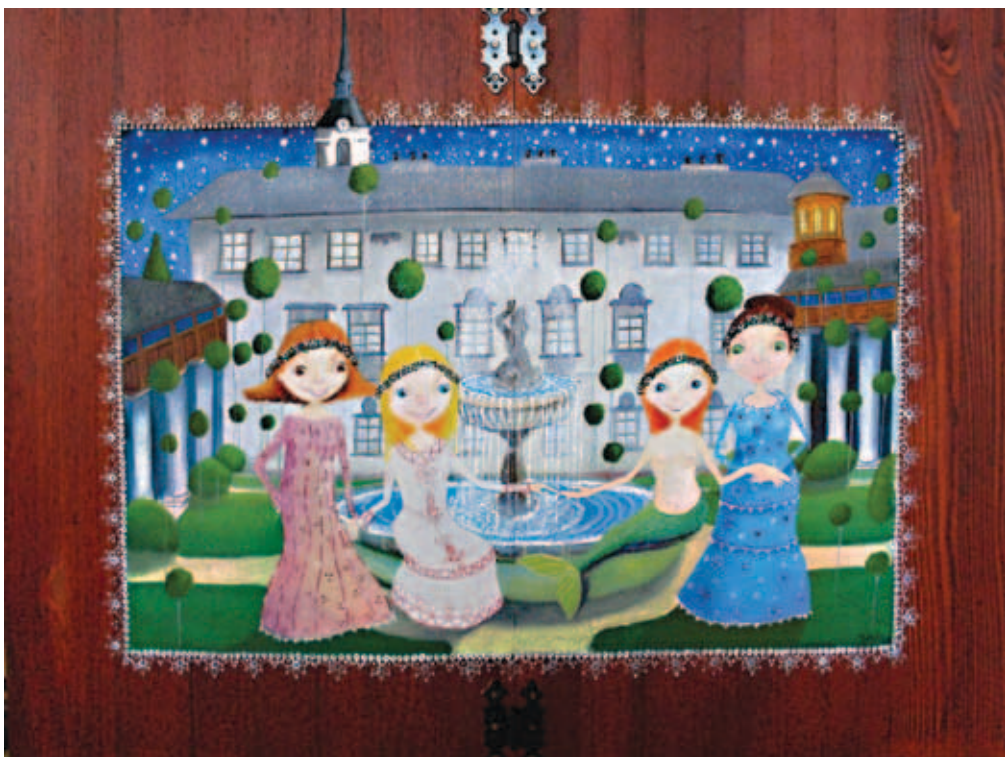
The Serenyi Girls, 2018

Technique: oil painting on wood, hardboard