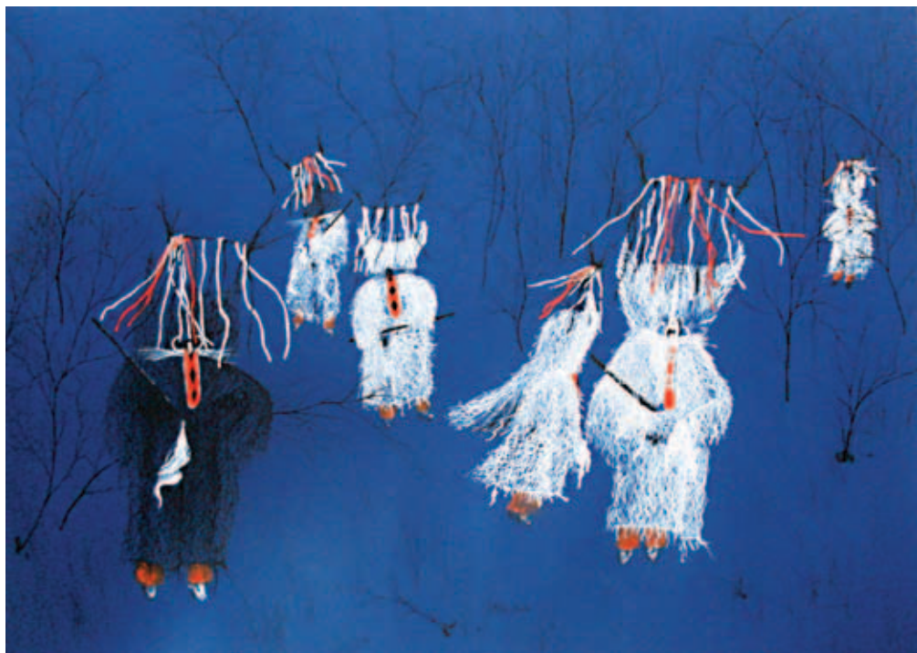
The Kurent, the Carneval Figures of Ptuj, 2018