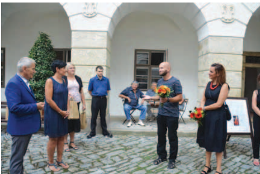
The artists thank the organisers of the convention