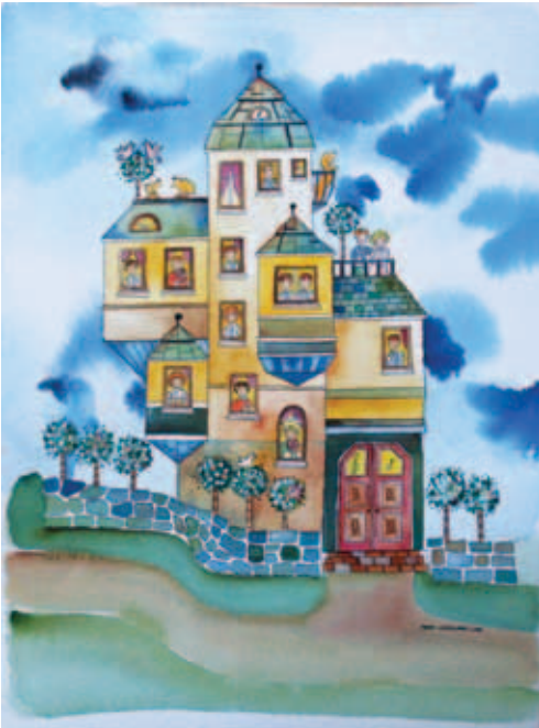
Our Favourite Songs, 2018