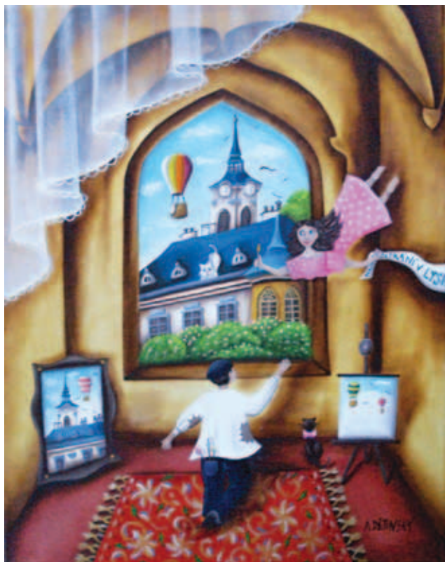
Waiting for the Muse of Lysice, 2018