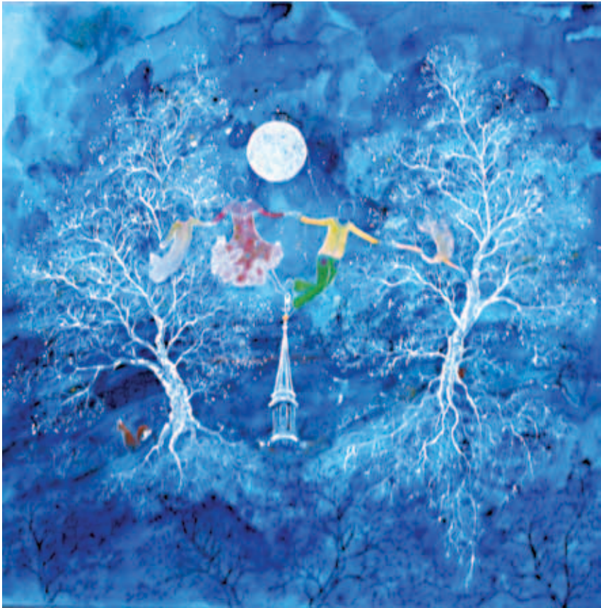
The Moon Children, 2018