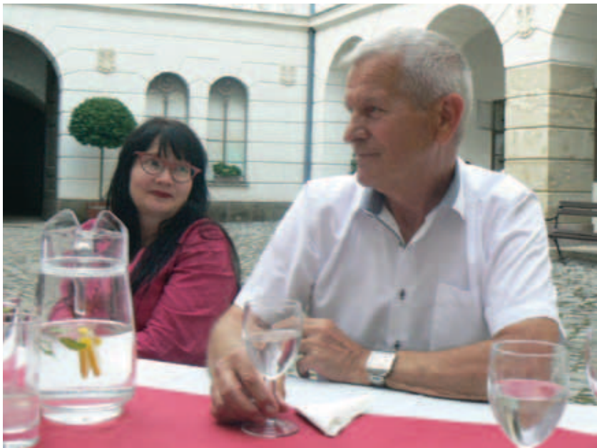
A pleasant get-together with friends and the end is here