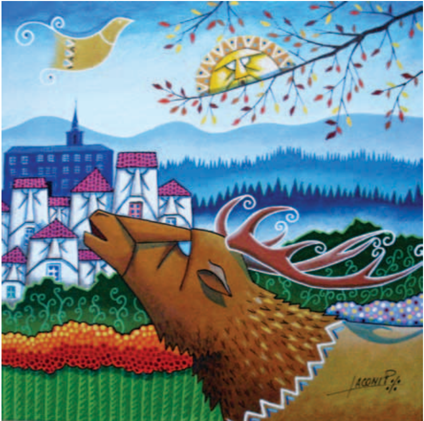
The Autumn in Lysice, 2018