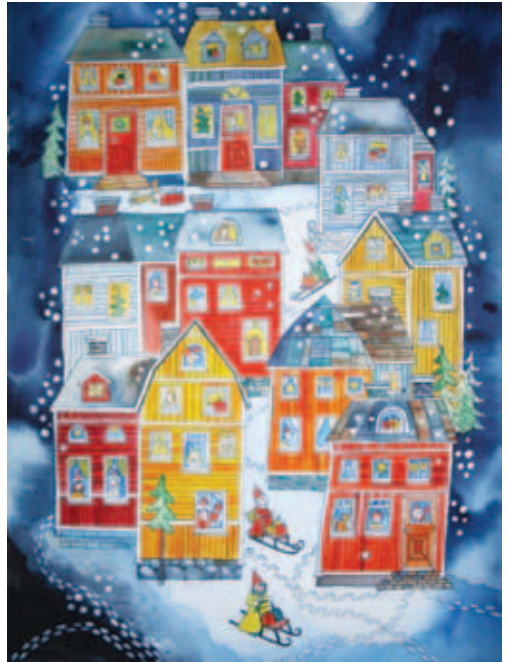
Wintertime in the City, 2018