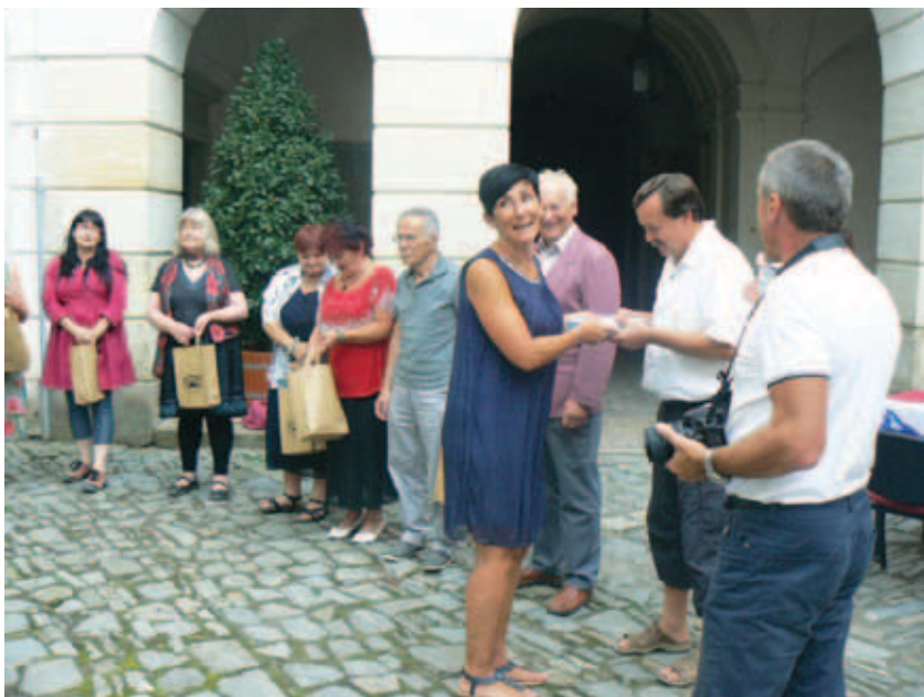
Thanks to our partners and sponsors