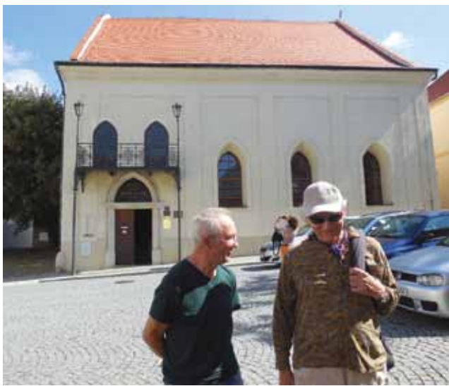
Trip – Porč Mill