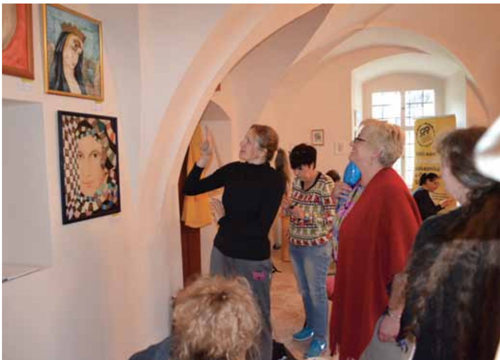
Opening of the gathering